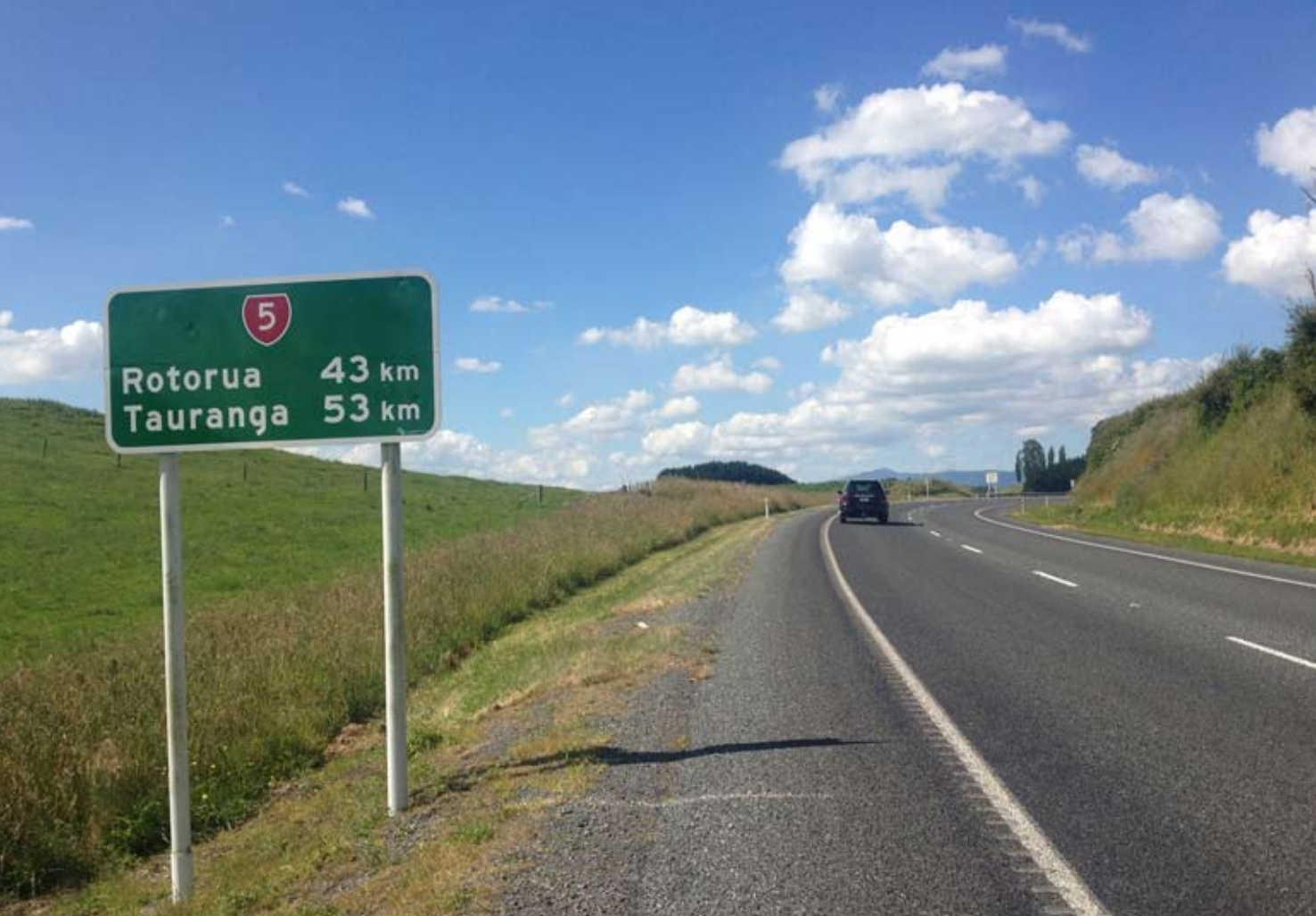
Back in the saddle and pedaling down the left side of the road -- heading south to Rotorua.